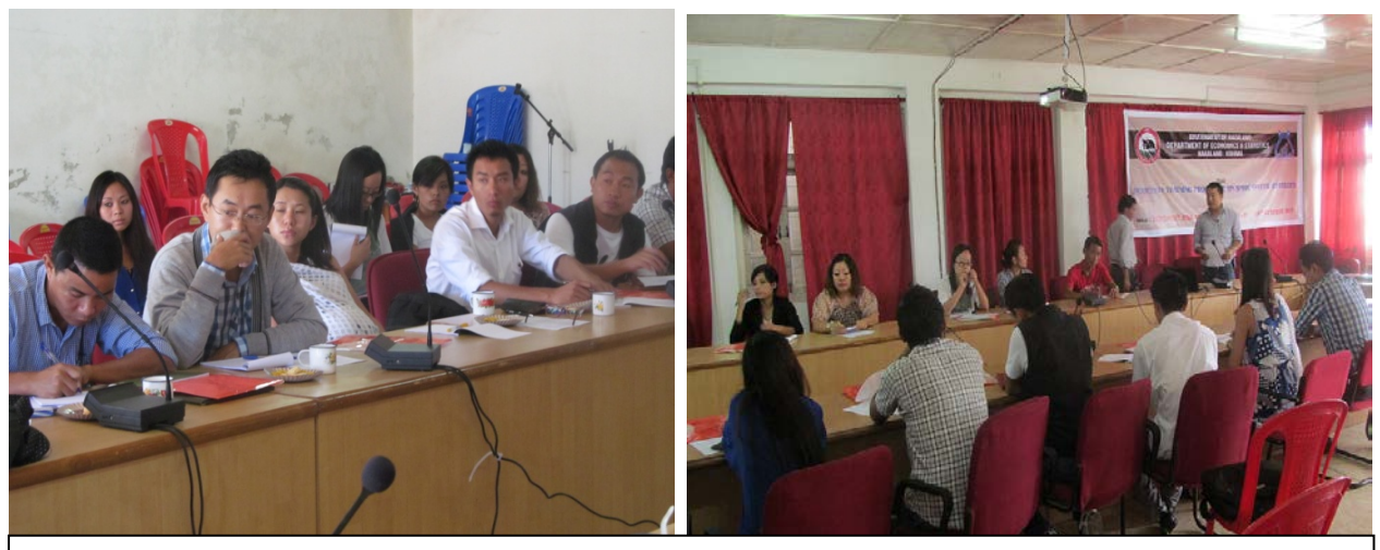
Officers and Staff during the Induction Training held at DES Conference Hall