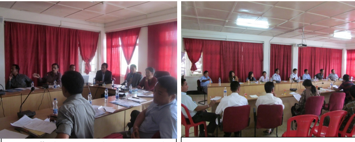
Ministry Officials imparting On-line Training on Births & Deaths to DES and District officials

The Directorate of Economics & Statistics as nodal agency for statistical activities, it is essential for statistical personnel to acquire and up date high proficiency in statistical techniques and methodologies from time to time. Keeping this in view, the Department has deputed a good number of officers and staff to various in-service trainings conducted by Ministry of Statistics & Programme Implementation (MoSPI) National Academy of Statistical Administration (NASA), Government of India etc, such as; Basic Statistics during 27-31 August 2012 at National Academy of Statistical Administration(NASA), Greater Noida, UP. Training on `National Accounts' during 17-21 September 2012, at National Academy of Statistical Administration (NASA), Greater Noida, UP.