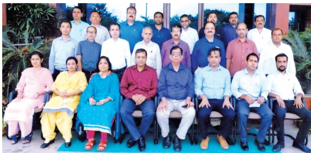
Officials of DES, Nagaland along with other state /UT participant at National Statistical Systems Academy (NSSA) , Greater Noida attending training on "Large Scale Sample Survey"

As the nodal agency for statistical activities in the State and given the necessity for statistical personnel to update their proficiency in statistical techniques