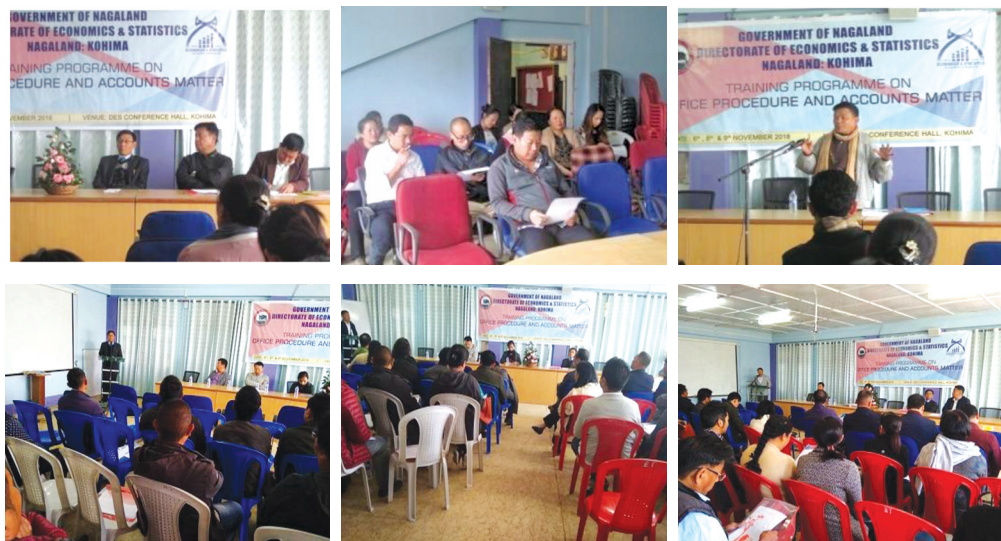
Training on office procedure for DES Hq. Officers and Staff in progress

A training division in the Directorate has been established to develop and formulate need based training modules for enhancing human resource capacity of the Department. As part of strengthening the statistical system in the State, the training division conducted in-service training for officers and staff of the Directorate and the District Statistical Officers on office procedures, official statistics, basic computer application etc. Sensitization and orientation programmes were also conducted for all at the grass root and institutional Registrars of births and deaths.